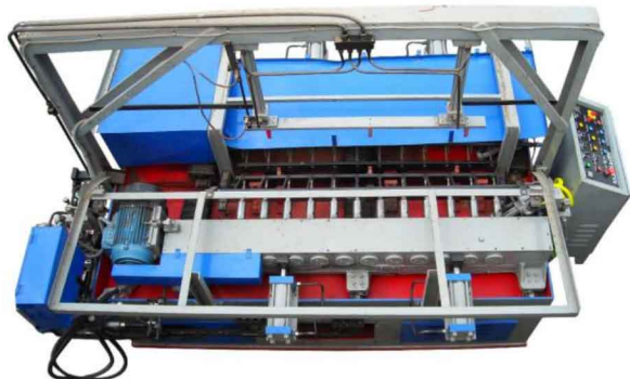
Scaffolding Multi Drilling Machine